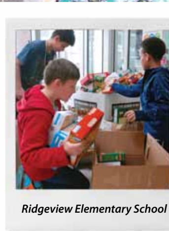
Ridgeview Elementary School

The Parent Teacher Student Advisory (PTSA) Council, Bloomington School Board and its Youth Advisory Council coordinate the annual food drive.