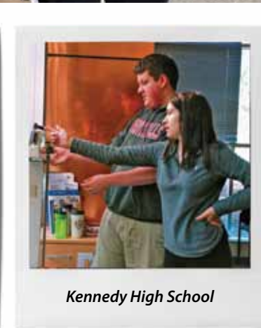
Kennedy High School