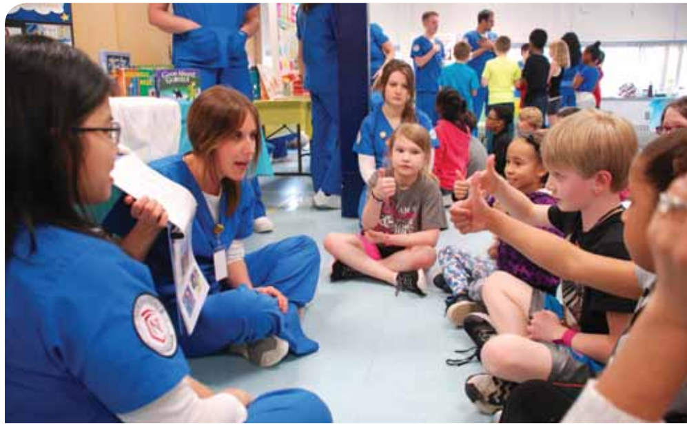
Westwood Elementary School students learn healthy eating tips from Normandale Community College nursing students during the school's annual Health Fair.

For information on labor negotiations, visit bloomingtonschools.org/negotiations . This page is updated periodically with new information, communications and frequently asked questions.