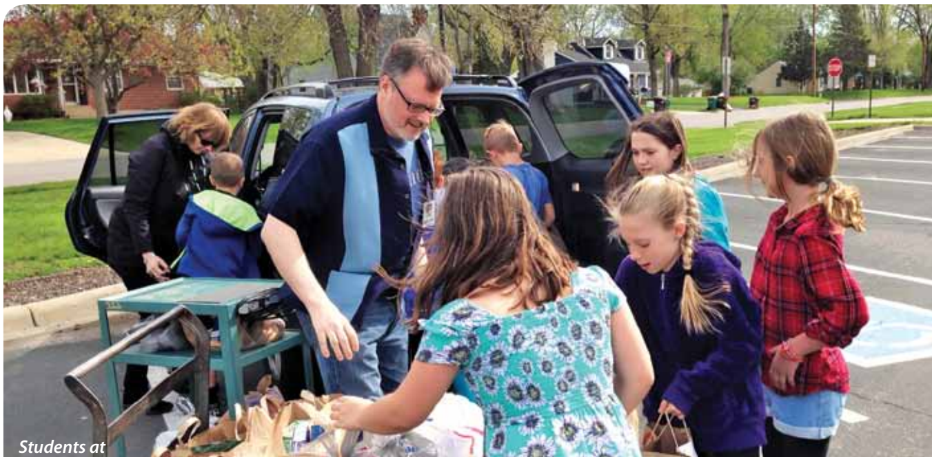
Students at Westwood Elementary School load their food collection.

B loomington Public Schools set an all time record in food and cash donations during this spring's 8th Annual District-wide Food Drive.