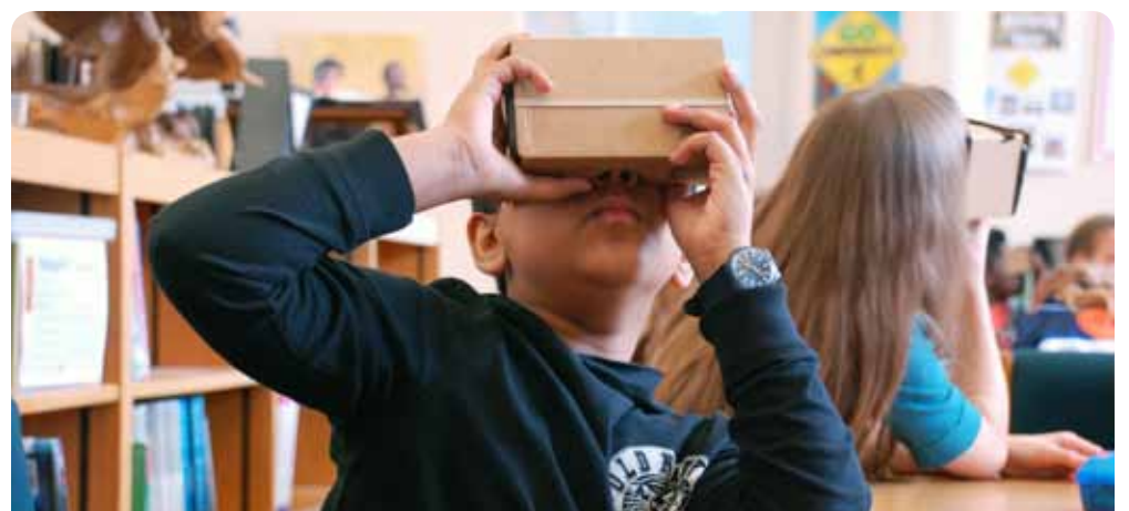
Students at Poplar Bridge Elementary School take a virtual field trip with the help of Google Expeditions using Google Cardboard virtual reality goggles.