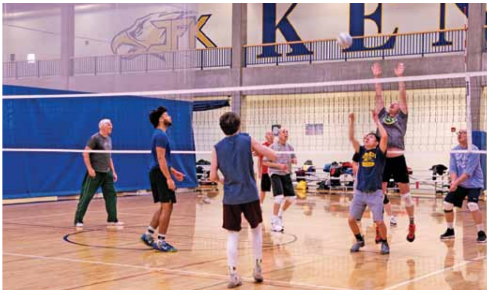
Kennedy High School phy. ed students face community members in a game of intergenerational volleyball. The Born Again Jocks gather three times a week every winter to play volleyball at the high school activity centers. Phy. ed teachers organize student vs. BAJ games a few times each season.

Jefferson and Kennedy high schools' 2018 graduation ceremonies will be held at 7 p.m. June 4 and 5 respectively at the Minneapolis Convention Center.